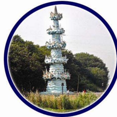
Bhavani Island 19.4 km

BHAVANI ISLAND is situated in the midst of the Krishna River, at Vijayawada. It is located at the upstream of Prakasam Barrage and is considered as one of the largest river Island, with an area of 133 acres.