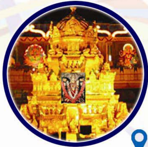
Sri Kanakadurga Temple 18.3 km

A famous Hindu Temple of Goddess SRI KANAKA DURGA located in Vijayawada, Andhra Pradesh. The Temple is located on the Indrakeeladri hill, on the banks of Krishna River. This temple is next to tirupathi Balaji Temple in attracting Pilgrims.