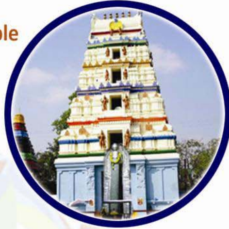
Dhyana Buddha 41.2 km

Amaravathi Temple, AP Capital SRI AMARALINGESWARA SWAMY TEMPLE is one of the Pancharama Kshetras which is located in Amaravathi Town near Guntur.